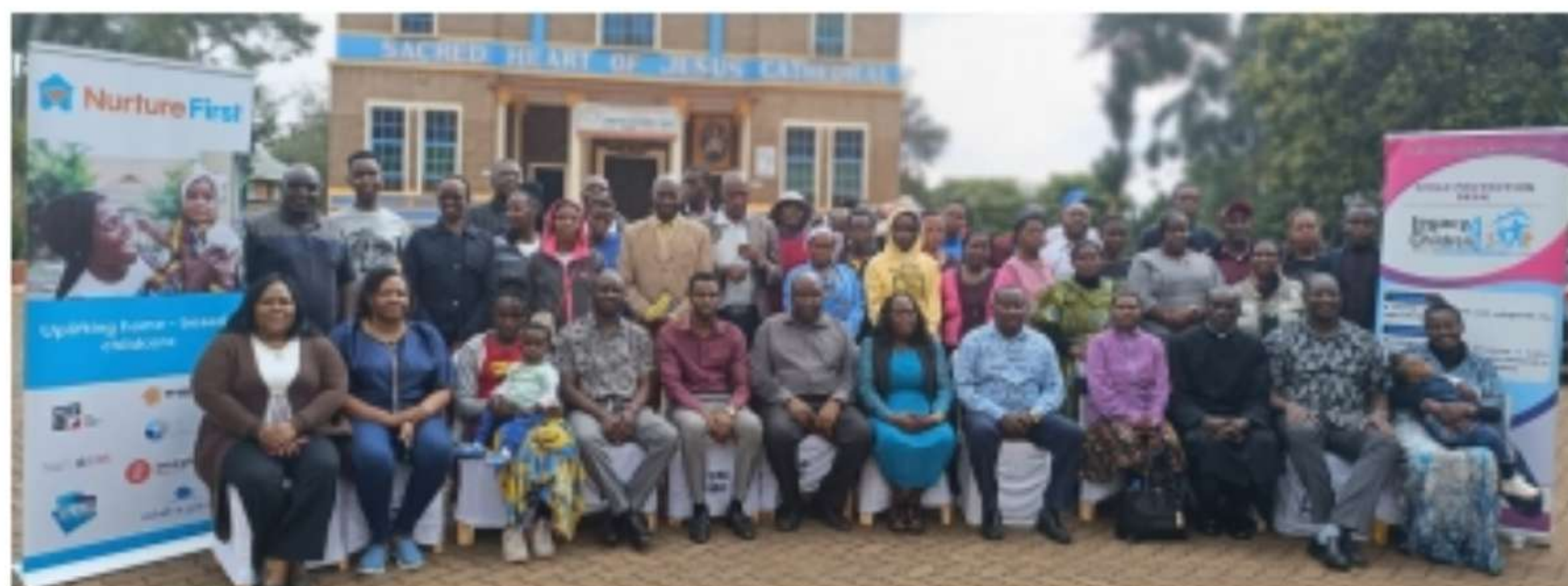
CCLs managers, HBCC services providers and parents during the stakeholders engagements on the draft policy