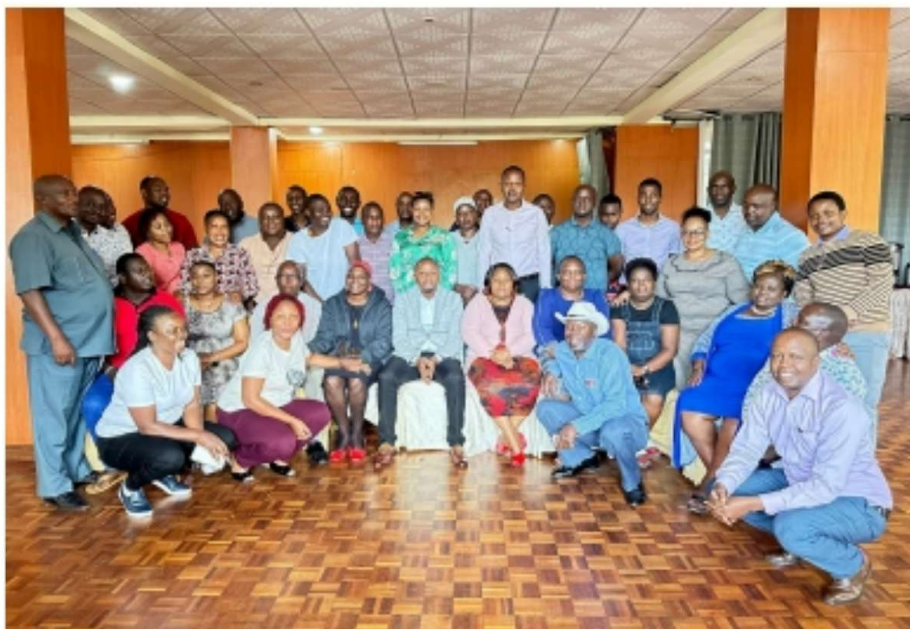
Engagement forum with the Hon. members of the Murang'a County Assembly