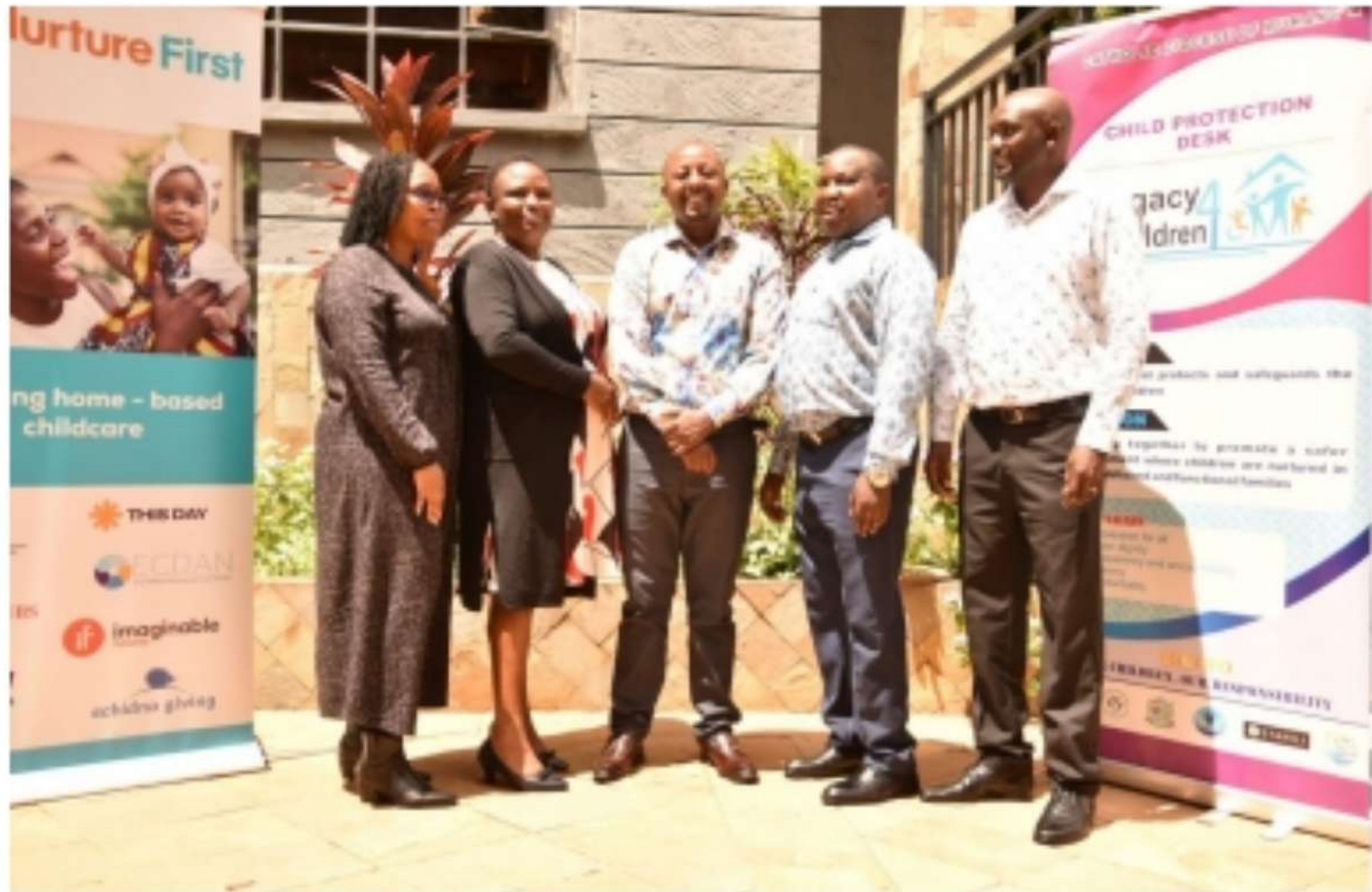
Partners meeting with the County Government on developing the policy framework