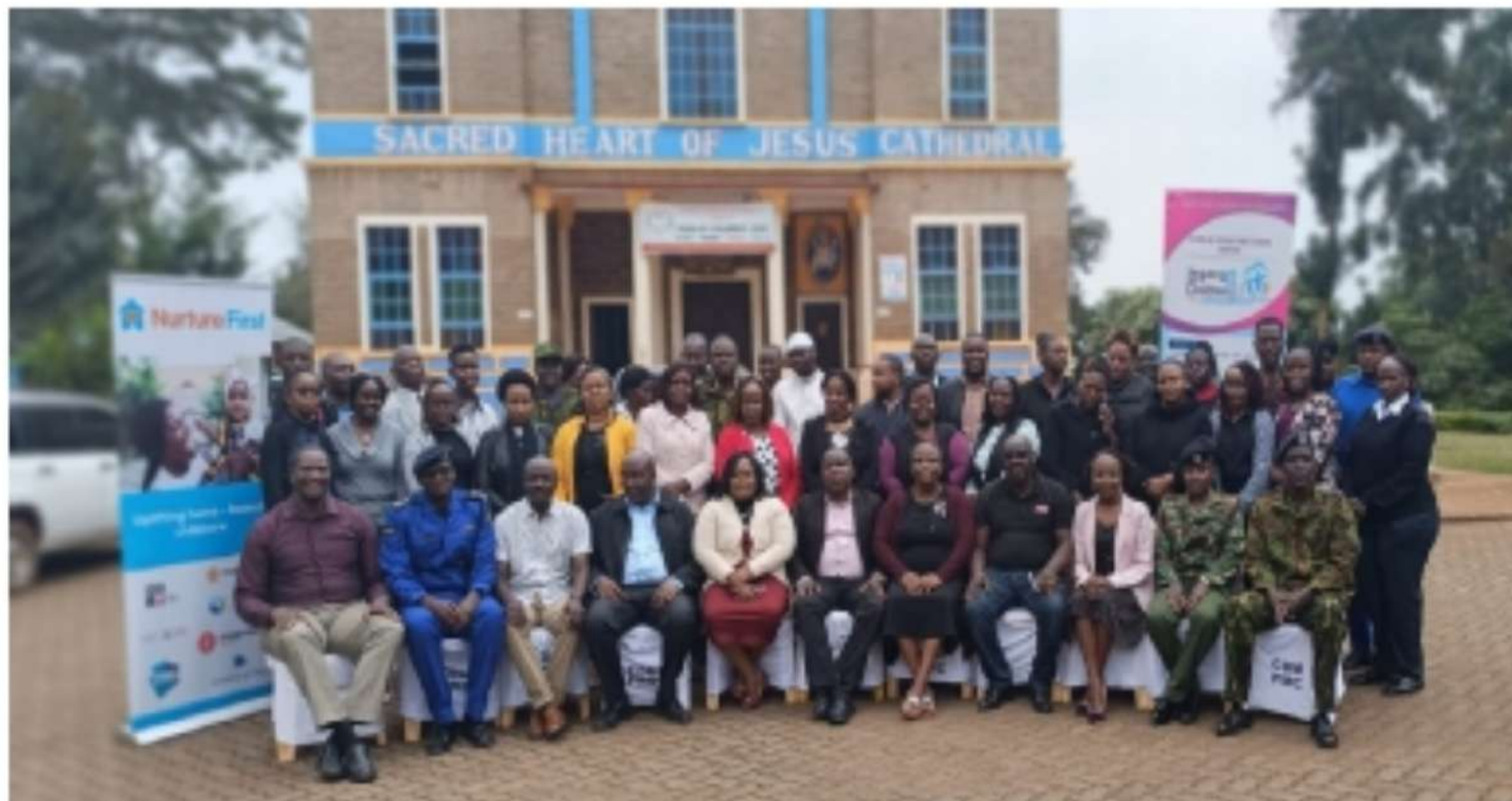
Stakeholders forum on 15th August 2024 bringing together the CUC, CCAC and the National Police Service