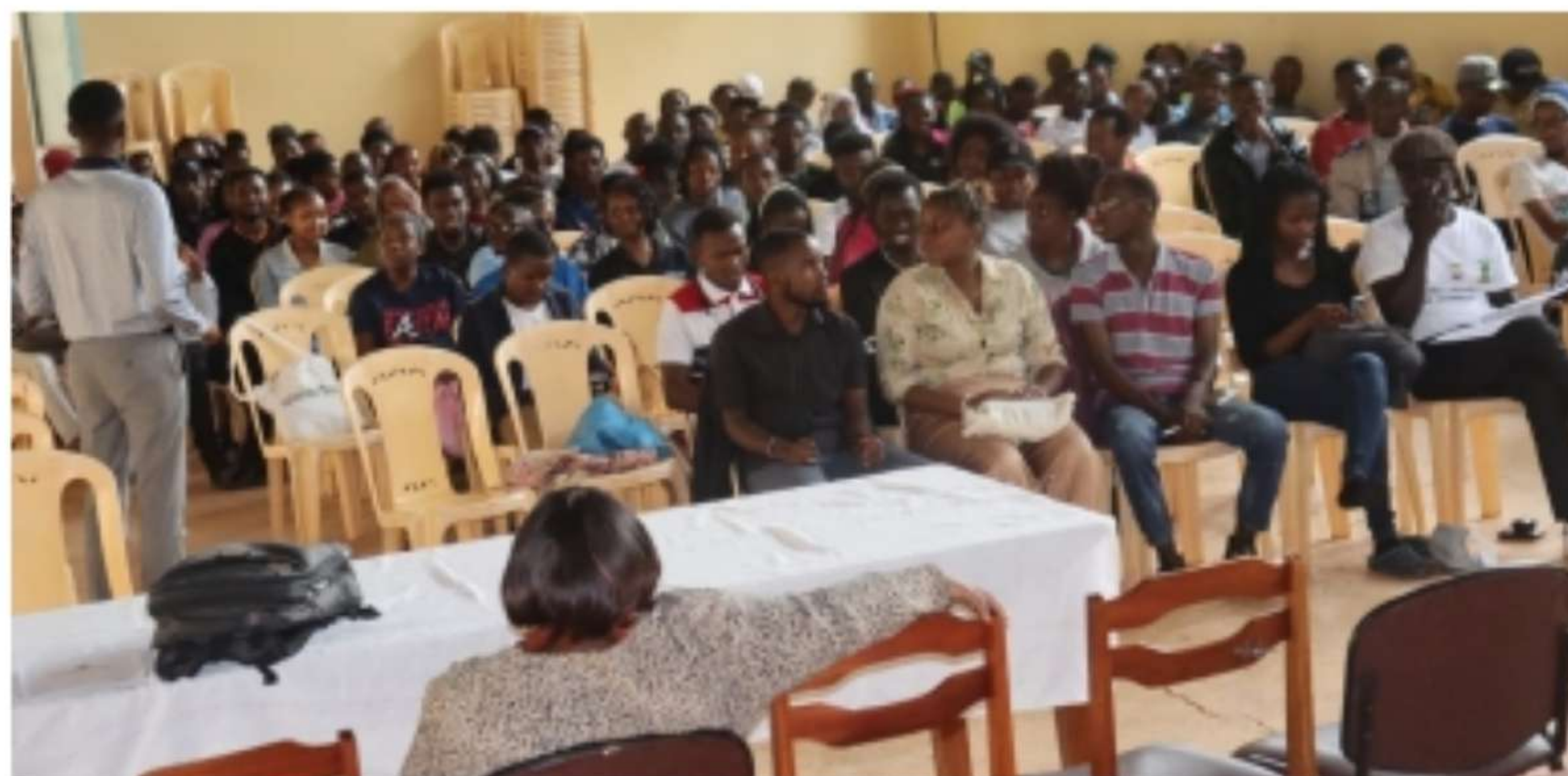
Public participation at Murang'a CDM hall on 13th November 2024