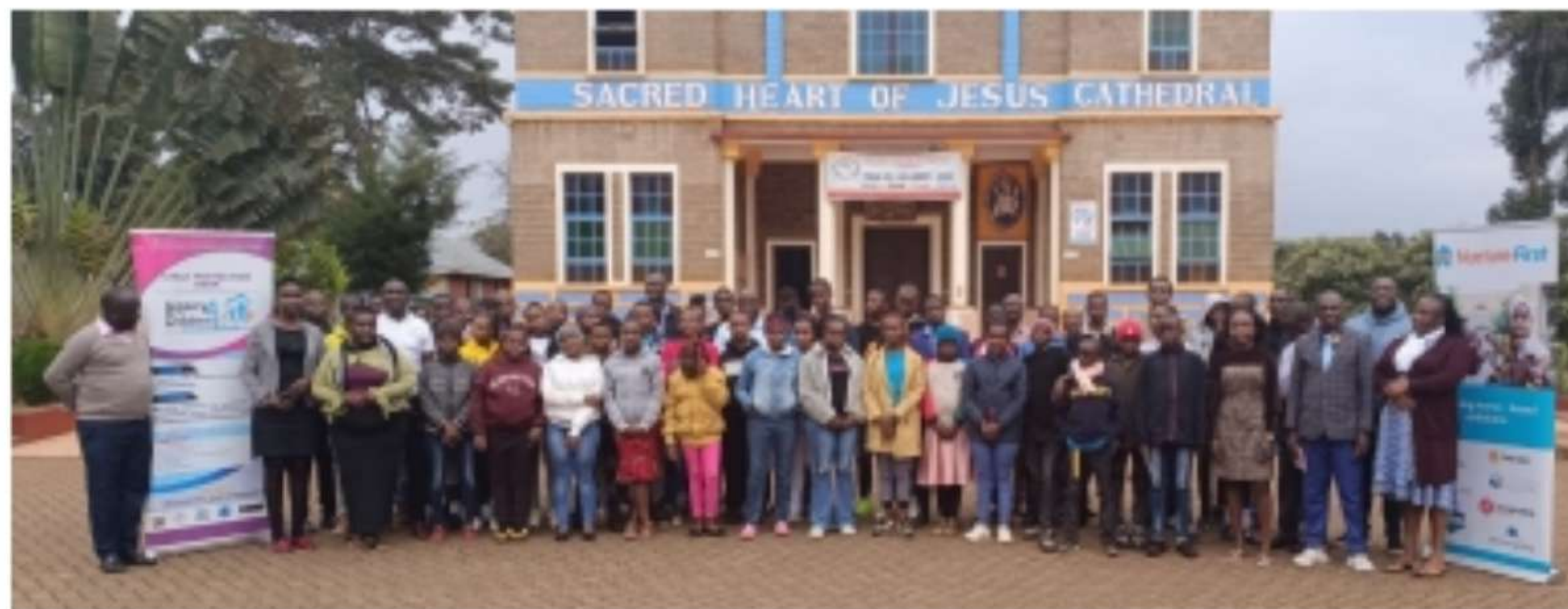
Child participation Forum on 21st August 2024