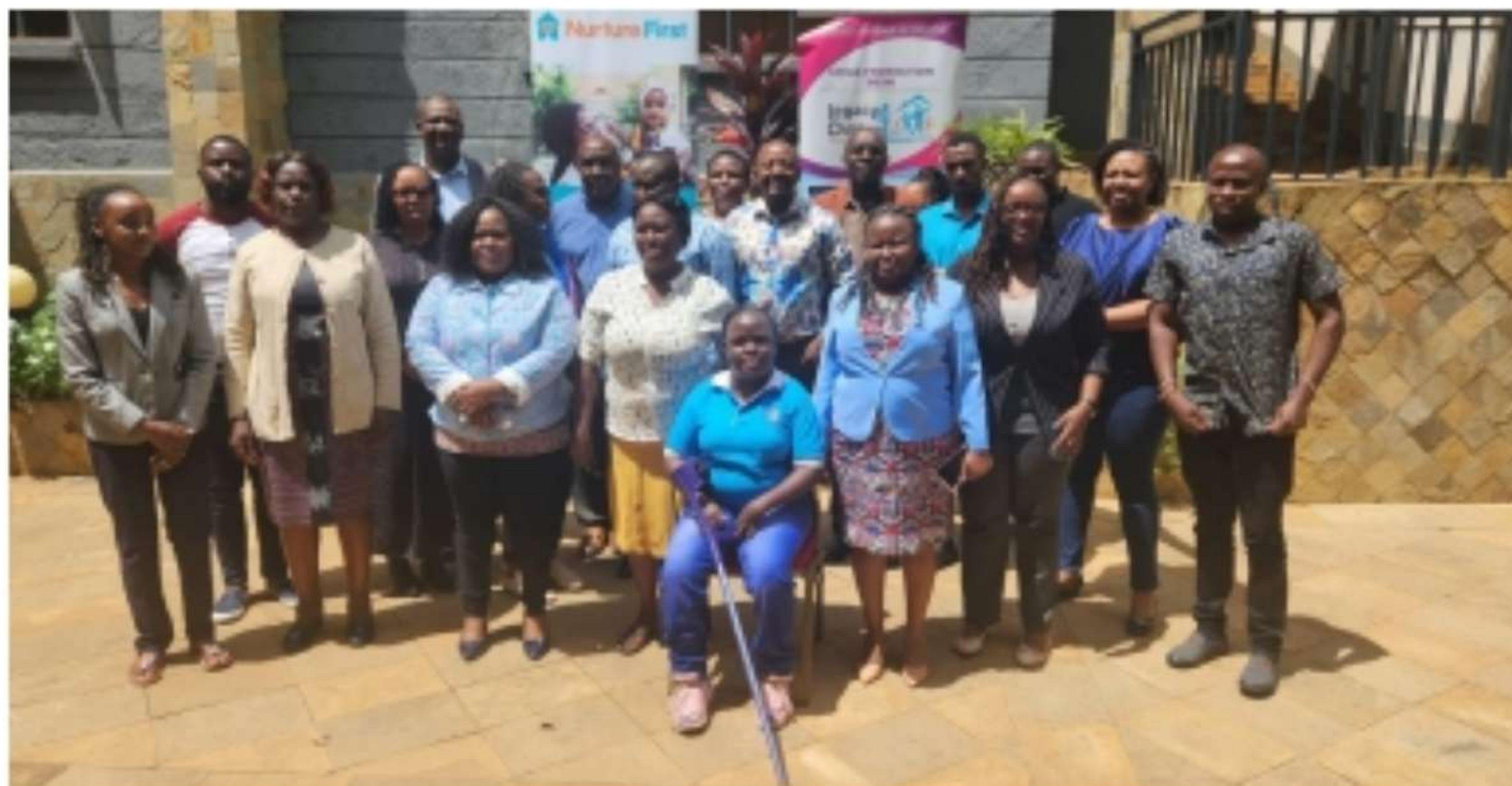
A section of the Technical Working Group during the policy drafting workshop