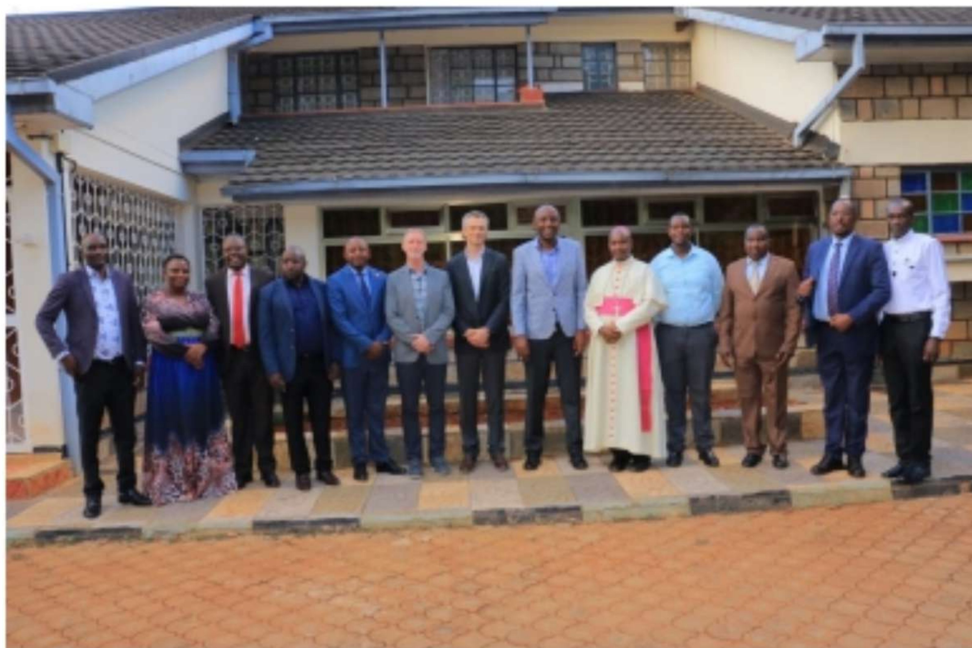
Signing of the MOU between the County Government and the Catholic Diocese of Murang'a on 6th March 2024